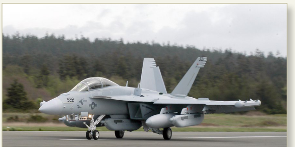
EA-18G next-generation electronic attack aircraft