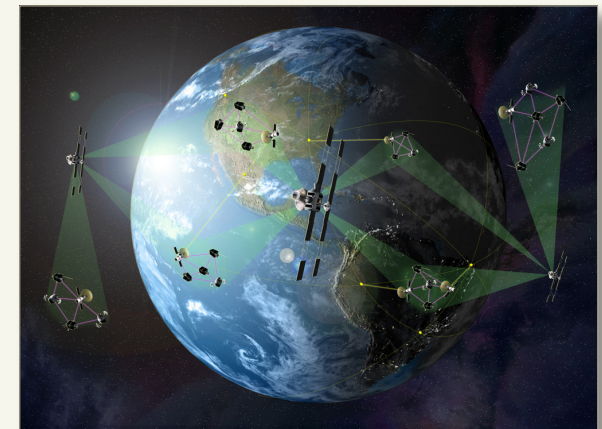
Space communications along with terrestrial microwave and fiber optics provide the core capability required to implement the global cyberspace network.